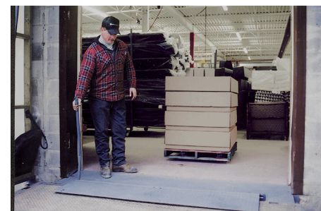
Safety is enhanced through less operational effort. Increased convenience and safer than aluminum dock plates.