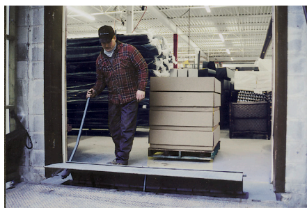
The edge of dock lip automatically locks as the deck is extended.