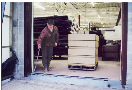
Torsion spring assist and integrated handle result in low effort activation.